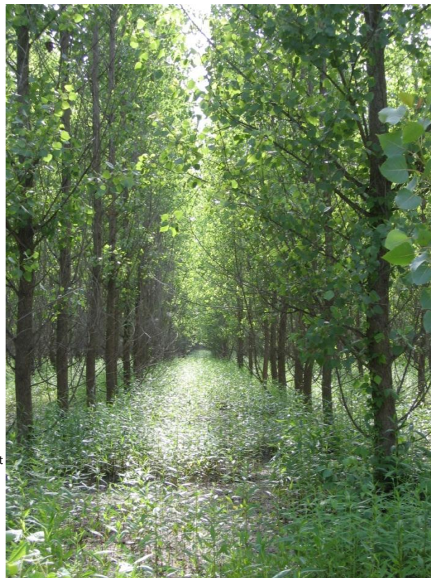
Planted Hardwood Stand. West Kentucky