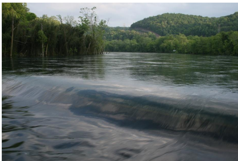
Water flowing over weir dam. Clinch River, Tennessee