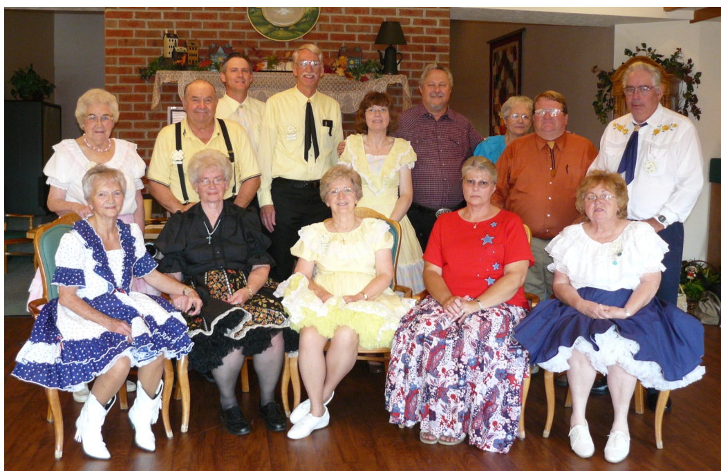
Above photo: Cloverleaf Squares at Hearth & Home.