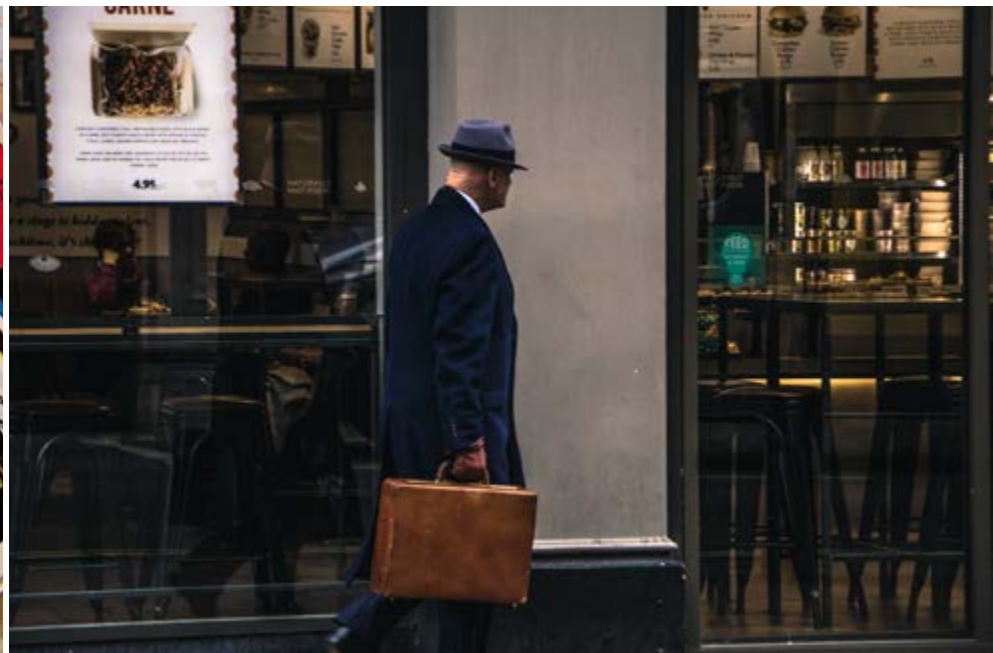
The room - See an aristocratic home, which cannot be identified (top left); Man with briefcase - On a secret mission (above right)