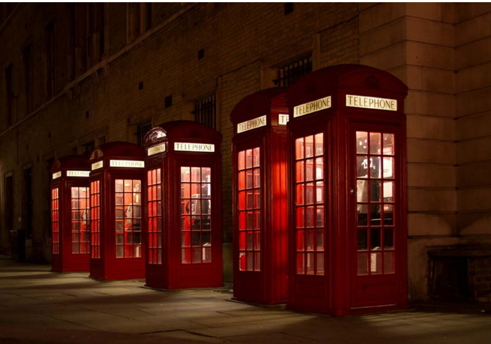
An undisclosed London location

London is full of secrets. Its long and multilayered history takes many twists and turns and even today there are sides to London many people will never see.