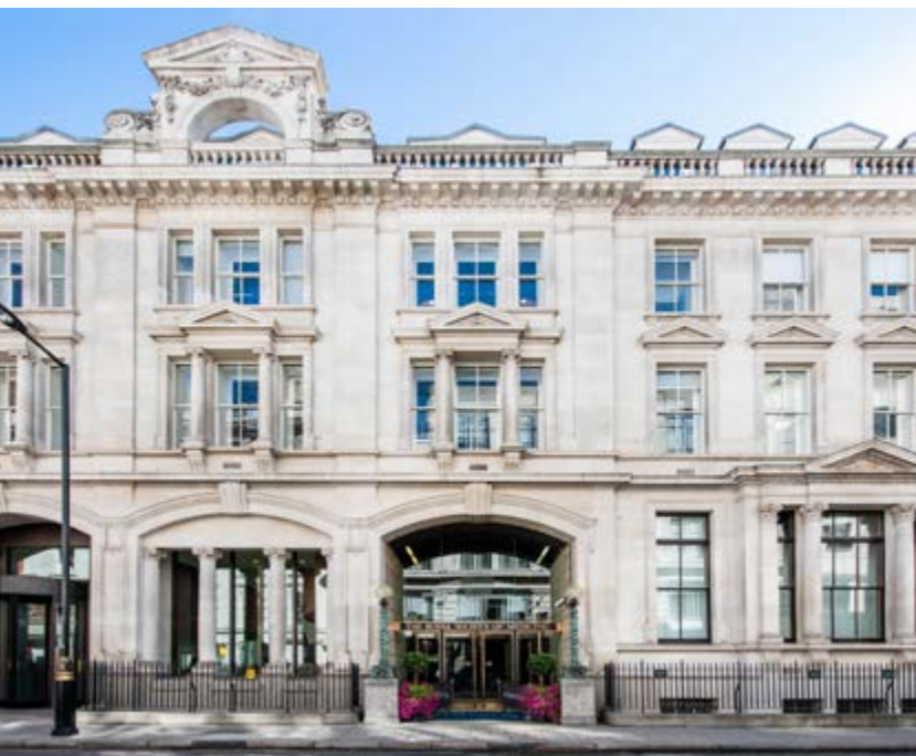
The Royal Society of Medicine