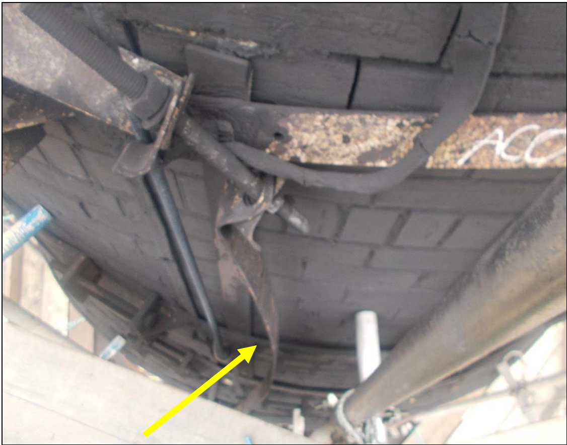
Section of the band left hanging