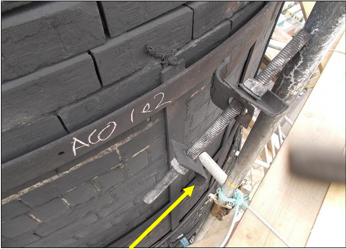
Location where the band had failed