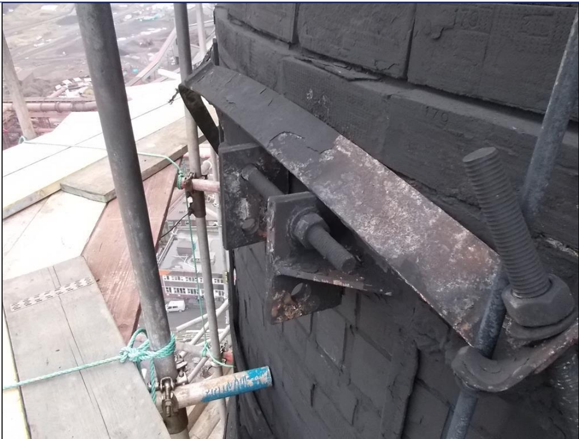
Sections of the band lodged behind a lightning conductor air terminal