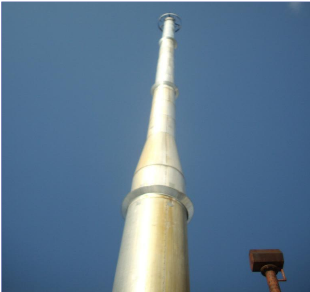
The 36.0m tall chimney prior to the inspection - fully clad and insulated

An ATLAS member company was recently tasked to complete an HSE/ATLAS 8 year survey on a free standing self-supporting single flue industrial chimney. The chimney was externally insulated and clad and its diameter removed the feasibility of inspecting the structural steel walls internally. To facilitate the survey, the external insulation and cladding needed to be removed to gain access to inspect the structural steel walls of the chimney.