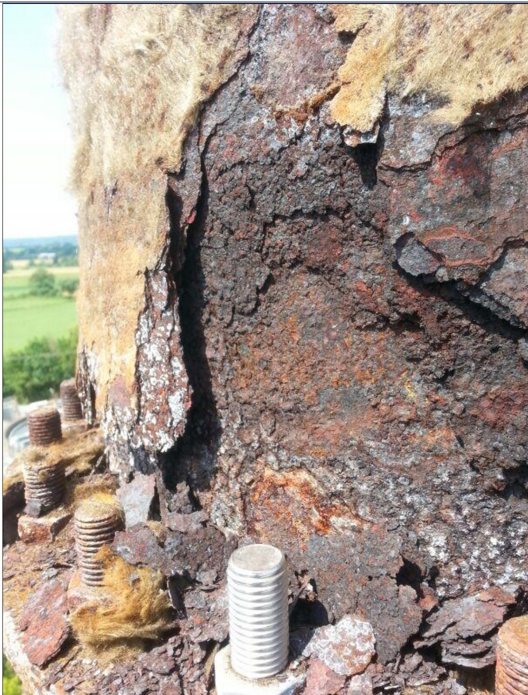
Advanced corrosion at the top flange – structural walls were found to be paper thin.