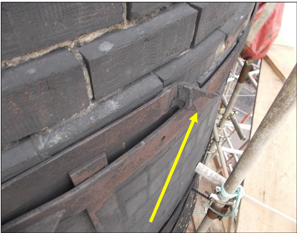
Section of the failed band stuck behind other steel work