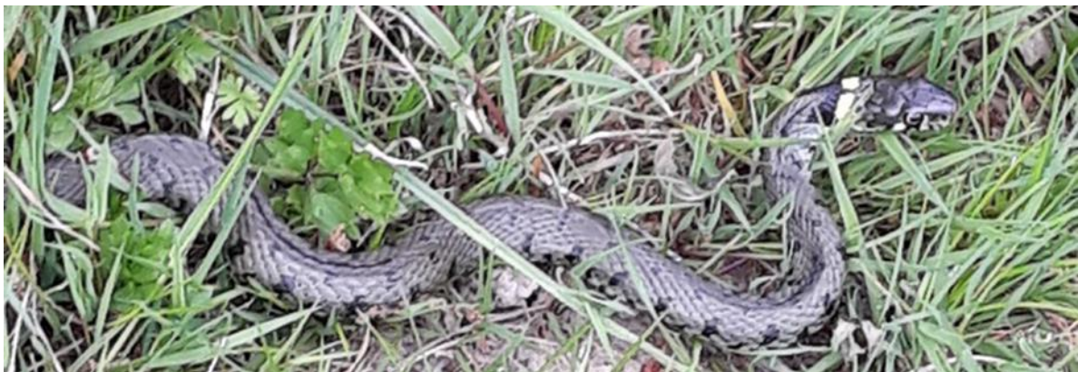
Grass snake: Capel

The initial report held the intention is to assist Save Capel persuade TWBC to look for more suitable locations for the borough's housing need, particularly brownfield sites, including in Capel, and the urban generation that is so needed in Tunbridge Wells. However, TWBC continues to pursue development in open countryside, so the report has been updated for Regulation 19 scrutiny.