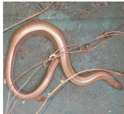
Slow worm: Sherenden Lane