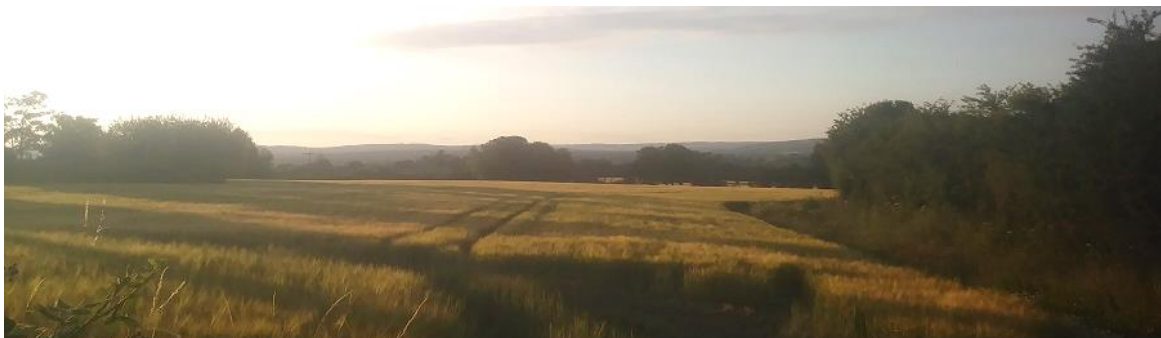
View of a portion of the Tudeley site from Crockhurst Street

Conclusion: It remains to be seen how effective the strategies are, and whether TWBC has properly considered their environmental responsibilities, or is skirting around them. Promises of net biodiversity gain will need rigorous examination.