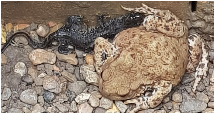
Great Crested Newt and Common Toad: All Saints Church

reptiles such as slow worms, grass snakes, toads, frogs and lizards. There is a wide variety of insects upon which many animals and birds depend.