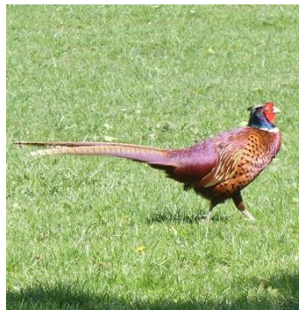
Pheasant: Sychem Lane