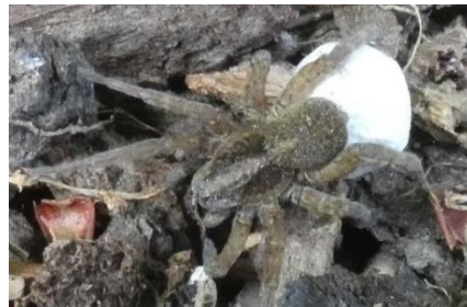
Spotted Wolf Spider with eggs: Capel