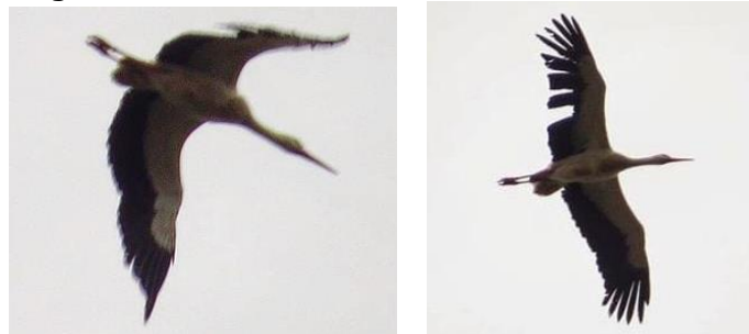
White Storks: Five Oak Green / Tudeley

"Looking at a map of the area there is a large amount of suitable foraging and nesting habitat nearby. They predominantly forage in grassland and flood plains, and will nest or roost in large trees, typically trees with open dead branches near the top or on building roofs."