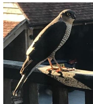
Sparrow Hawk: Alder's Road