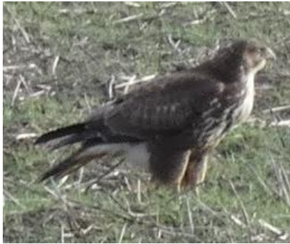
Common Buzzard: Five Oak Green