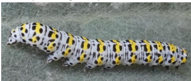
Mullein Moth: Five Oak Green

Insects abound in the area and support the wildlife as significant food source. As diversity and scale of the insect population is reduced through development, this also impacts negatively on the area's wildlife.