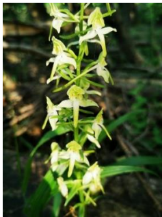
Greater Butterfly Orchid: Trooping funnels: Amhurst Bank Tudeley Woods

Hedgerows are the roadways for much wildlife, including EU protected Dormice, and provide nesting opportunities for a number of birds, but the removal of these natural corridors has been pervasive as fields widened. Creation of large housing estates will merely increase the problem and again impact on the wildlife dependent upon them.