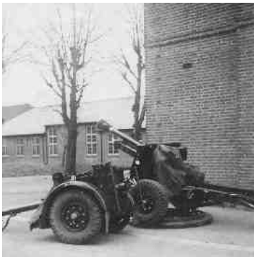
25 Pounder Fieldgun

Soon we had a chance to put into practice our convoy discipline because we moved the considerable distance from Worcester to Canterbury. Not long after we got there we were pleased to learn that the Morris Quads would be replaced by Albion six wheeler 15 ton Quads. In extreme circumstances all six wheels could be locked together for maximum pull and there was also a heavy winch on board. A lorry load of us went up to Glasgow and we drove the new vehicles from Glasgow to Canterbury over two days. We had two trips to fetch them and on the second trip the weather was very poor with much snow and ice around. We came across many