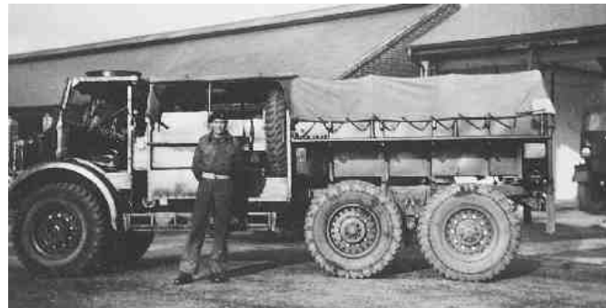
Me and the Albion 15 Ton Quad

Next we moved the short distance from Canterbury to Folkestone. One day when we were bored, some time after the spinning bren gun carrier incident, four or five of us went out in my Albion Quad to the training area. One of my mates asked how fast the Albion