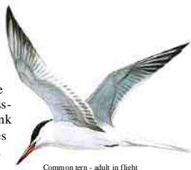
Common tern - adult in flight

So we are pleased that we are able to offer a good home and place to nest for many of our summer visitors this year. After waiting patiently for the larger Black headed gulls to use the tern rafts, the Common terns were at last, able to hatch and successfully fledge their chicks on these. It's inspiring to think that, whilst only a few months ago these little bundles of grey and white fluff were floating on RSPB Fen Drayton Lakes, they are now fully grown slender white Common terns flying over African skies.