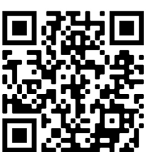
Smart Adapter Instruction Movie